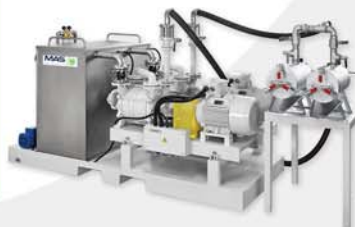
AUXILIARY • Closed Process Water Circuits • Throughput Scales • Silo Throughput Scales