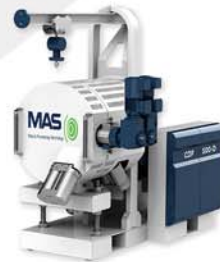
CDF Continuous Melt Filtration