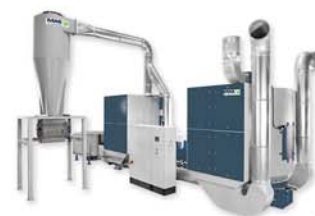
DRD Dry Cleaning