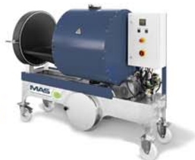
SC 700 Vacuum Ovens