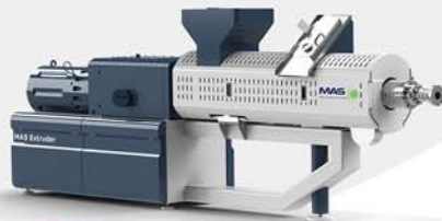
EXTRUDERS Recycling and Compounding

CHECK OUT MAS' ENTIRE LINE OF HIGH PERFORMANCE EQUIPMENT