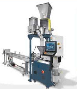
MAS 24 Lab Extruder