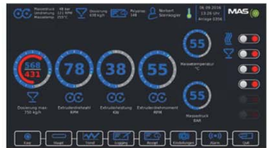
MAS multi-touch panel interface