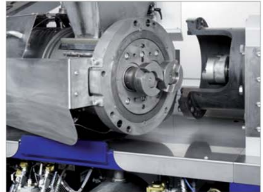
MAS 75 swiveling unit for screw removal

The MAS Extruder is controlled via a modern industrial control system with an 18.5" Multi Touch Panel and an intuitive interface. The MAS Software includes but is not limited to the following functions: automated start up and shut down procedures, recipe management, language control, unit switching, fault indication and logging, trend display (current and historical), operator management, data logging of events (user registration, change in value, ...), multi-touch and gesture control, remote diagnosis etc.