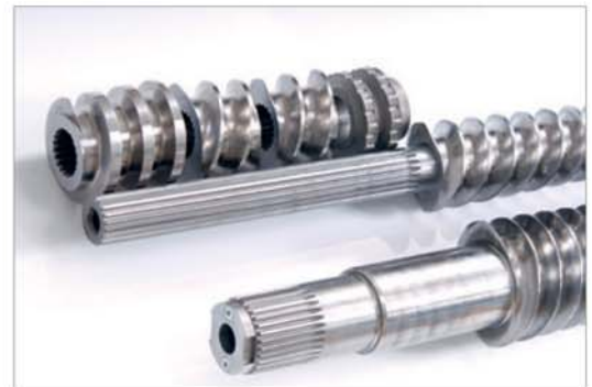
Screw segments: intake, mixing elements, discharge