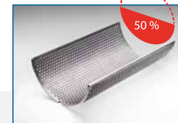
Screen equal to approx. 50% of the knives' rotation