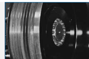
Flywheel and pulley mounted with taper-lock bushing