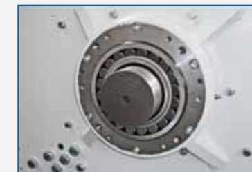
The use of spherical roller bearings that are directly mounted to the cutting chamber in cast iron housings ensure longevity of the machine

... All machines are manufactured according to the latest Safety Standards.