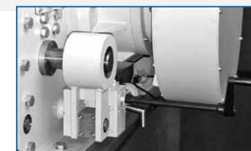
Opening of screen holder by manual jack