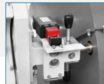
Rotor lock device for maintenance