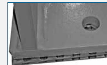
Base set on vibration dampers