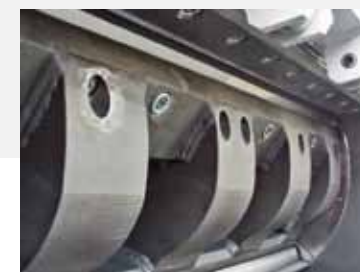
Rotor equipped with lateral discs Optional: Discs fixed to the cutting chamber