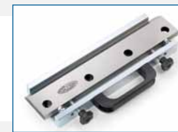
Adjustment of knives and counterknives can be performed separate from the machine