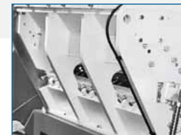
All cutting chambers can be offered in an antiwear configuration. This includes the lateral discs, the wear rings and the screen