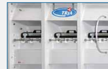
Water cooled cutting chamber