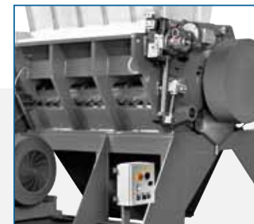
Motorized jack for hopper opening; integrated electrical control