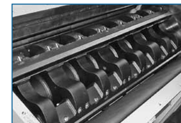
6-knife rotor with scissors-cutting configuration