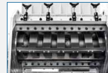
7-knife rotor with arrow-cutting configuration