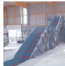
Chain belt conveyors