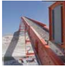
Throughed belt conveyor