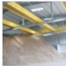
Troughed chain conveyors