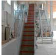
Chain belt conveyor