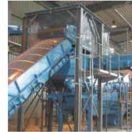
We plan and manufacture options and accessories such as covers, hoppers, dosing units, galleries according to customer wishes.