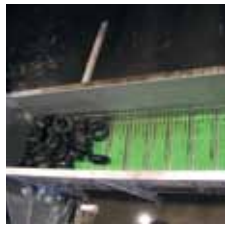
Feeding bunker slat conveyor