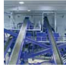
Complete conveyor systems