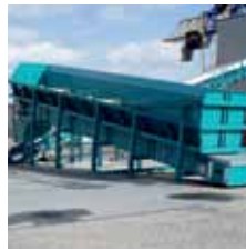
Feeding bunker for construction rubble