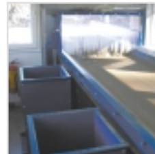
Sorting and sieving technology