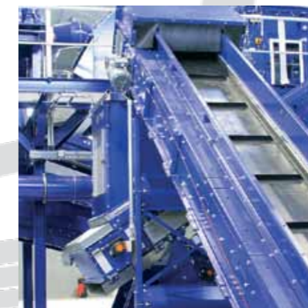
54 conveyors interlaced in a complex system with different length, width, velocity.