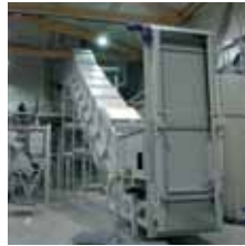
Gas proof chain belt conveyor