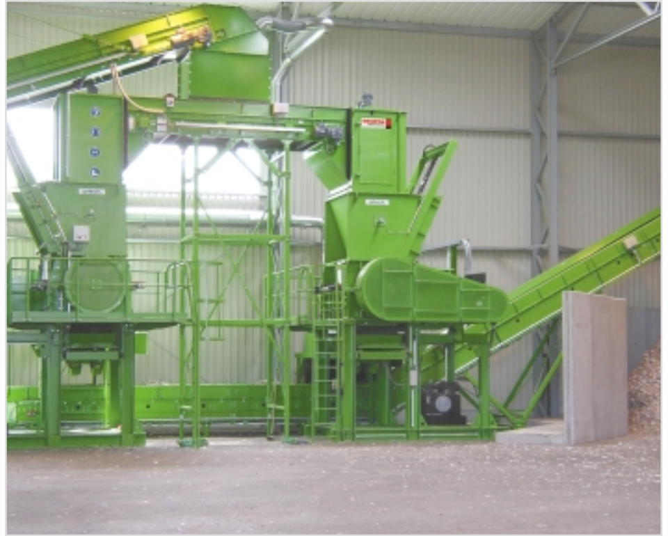
Conveyors stationary/pivotable /mobile for all applications