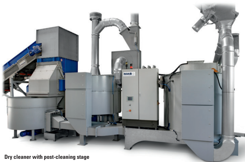
Dry cleaner with post-cleaning stage

Reprocessing. The dry reprocessing of plastics enhances the cleaning performance with simultaneous minimization of the required energy input. A one-stop concept couples the cleaning and extrusion of the plastics, thereby utilizing the heat generated and so contributing to an optimization of the recycling process.