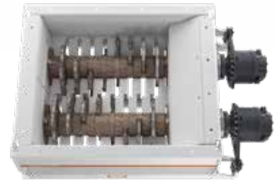
Cutting table 8 knives