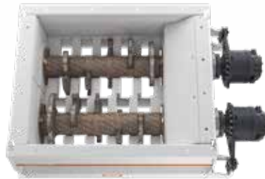
Cutting table 5 knives