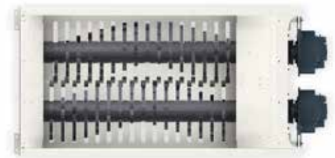
Cutting table 16 knives